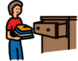
put in drawer